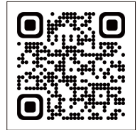
Booth Layout QR